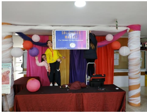
Commerce students decorated the stand themselves. Good job!

The solidarity market took place on the 3rd week of December as part of our school's interdisciplinary project. This market fundraised close to 800€ for the Vicente Ferrer Foundation project "Bicicletas con poder", aimed at purchasing bicycles for young female students in the state of Andhra Pradesh, India. These bicycles should help girls become more independent and allow them to go to school, which is sometimes very far from their homes. Students sold a wide range of products including homemade soaps, desserts, recycling items for Christmas Trees and second hand products donated by many members of the Andrés Benítez community. Thank you very much to everyone who contributed to making this a great success!