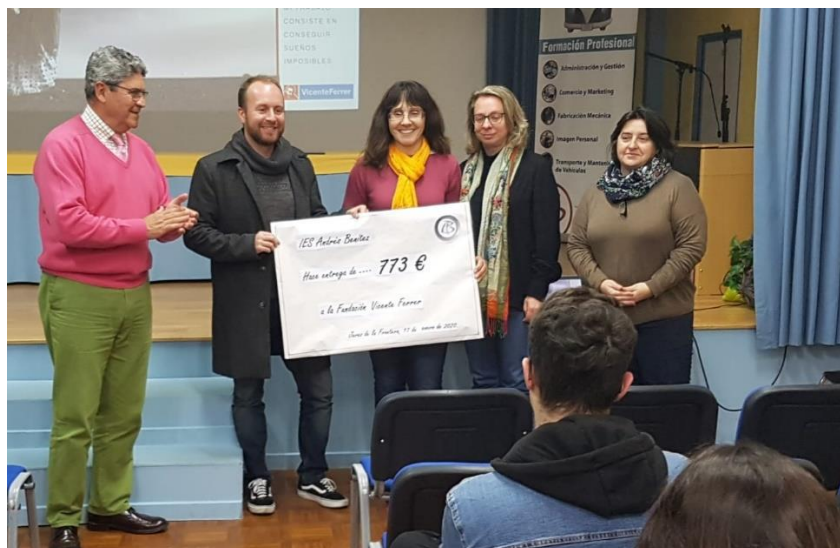
The principal of IES Andrés Benítez and members of AMPA gave a giant novelty cheque to a member of the Vicente Ferrer Foundation.