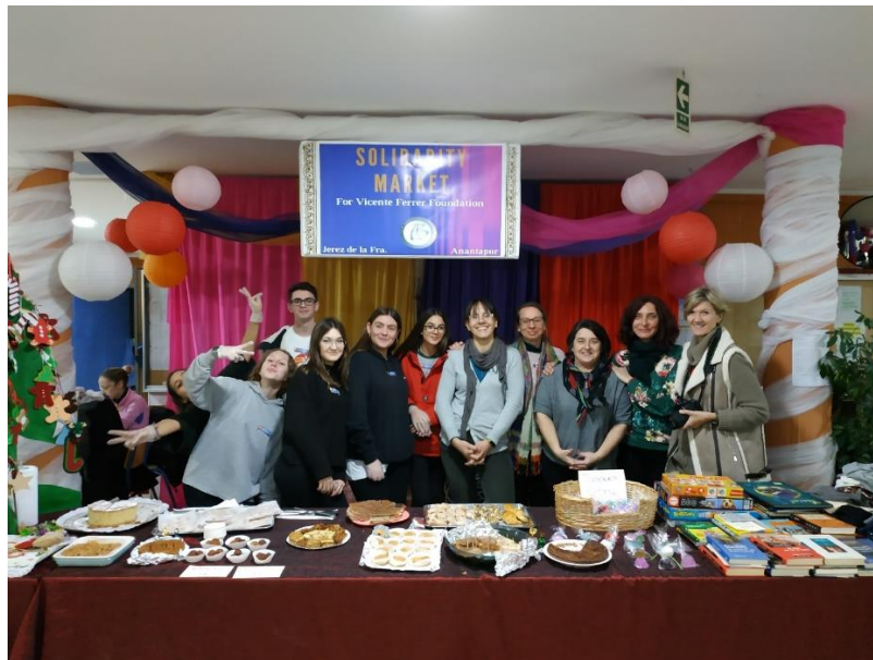
A group of students from 4º ESO and parents from AMPA who were very involved in this project.