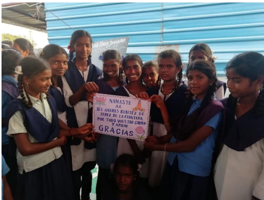
Receiving this picture was incredibly touching. We really hope that these and many more girls enjoy safely riding their bikes to school in the future.