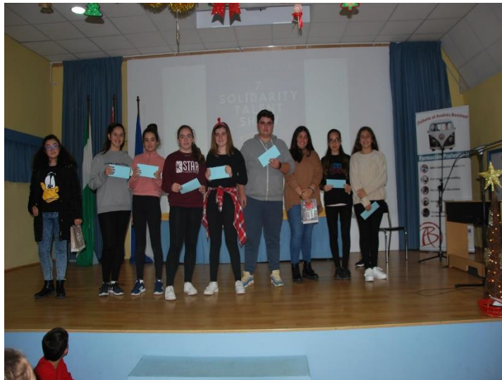
During the show the Language and Literature Department awarded some students for writing the best Christmas stories. Congrats to all of them!