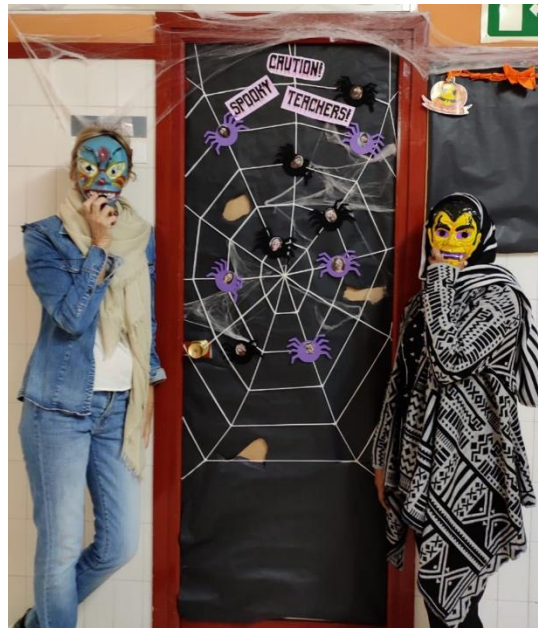
Similarly, many teachers chose to wear masks that day. Can you guess who they are?

On 31 st October, Spooky ghosts, witches and devils played tricks on our bilingual notice board.